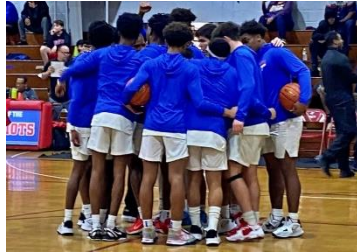
STATE CHAMPIONS 2012