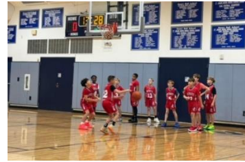
STATE RUNNERUPS 2015 2022